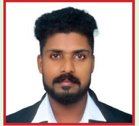
BERTIN B R