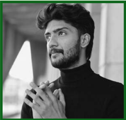
Al Ameen Karate Black belt Instructor